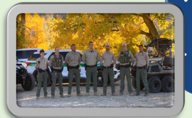
Park Rangers at Navajo Lake State Park