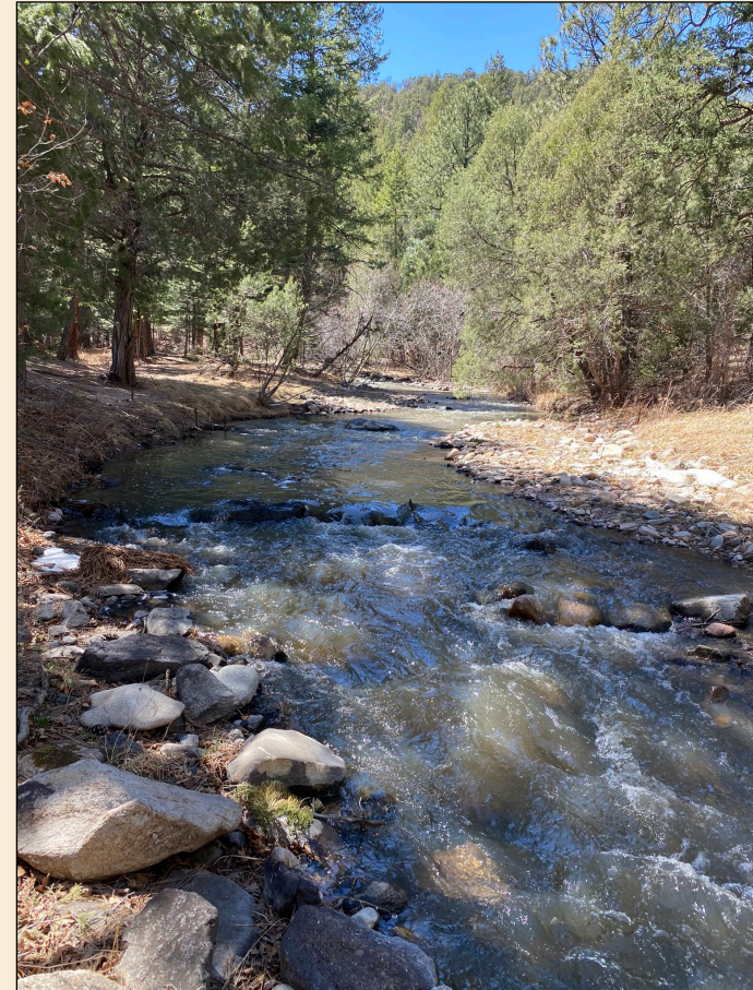
Cimarron River Trout Habitat Restoration, Cimarron Watershed Alliance

Provides funding and technical support for the planning, design, and construction of projects that enhance the health of New Mexico streams and rivers by improving surface water quality and/or river habitat.