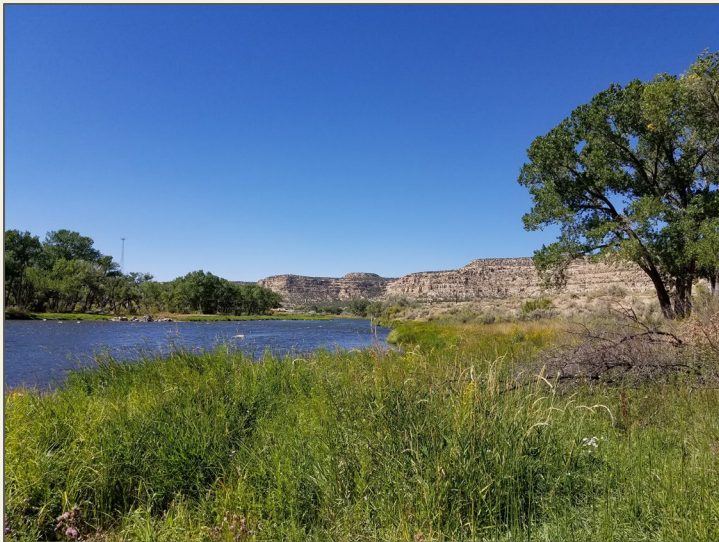
San Juan River Restoration, San Juan Soil and Water Conservation District