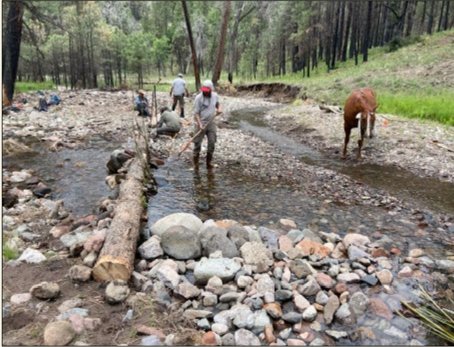
Restoration of Gila trout and riparian habitat on Black Canyon Creek, Bat Conservation International (Gila National Forest)