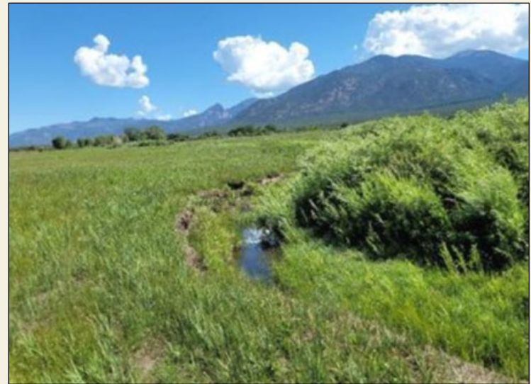
Taos Pueblo Ecological Restoration of Buffalo Pasture and the Rio Lucero Project