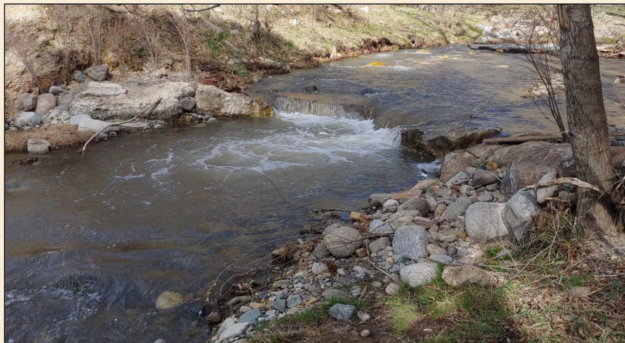
Two Rivers Park River Restoration Phase III, Village of Ruidoso