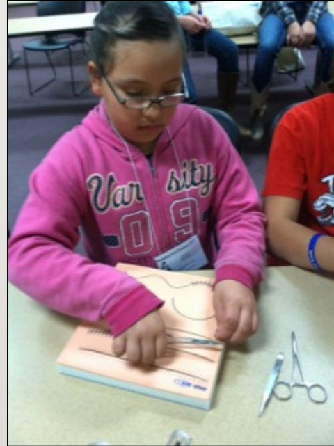
Expand Your Horizons 2015