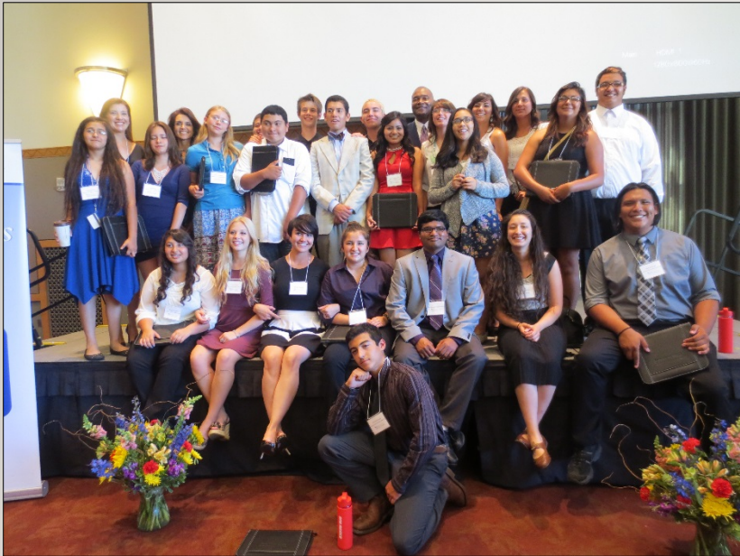
Health Careers Academy 2015