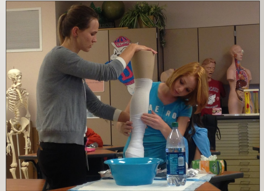
Dream Makers Club - 2016