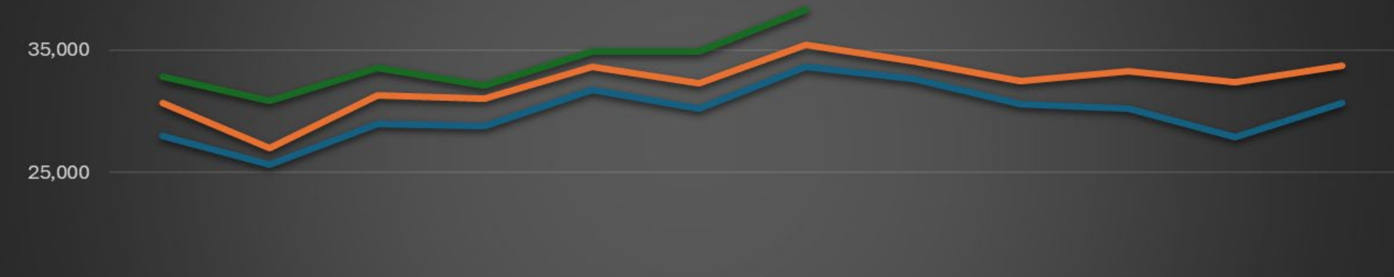
CLPOE Northbound POV 2022-2024