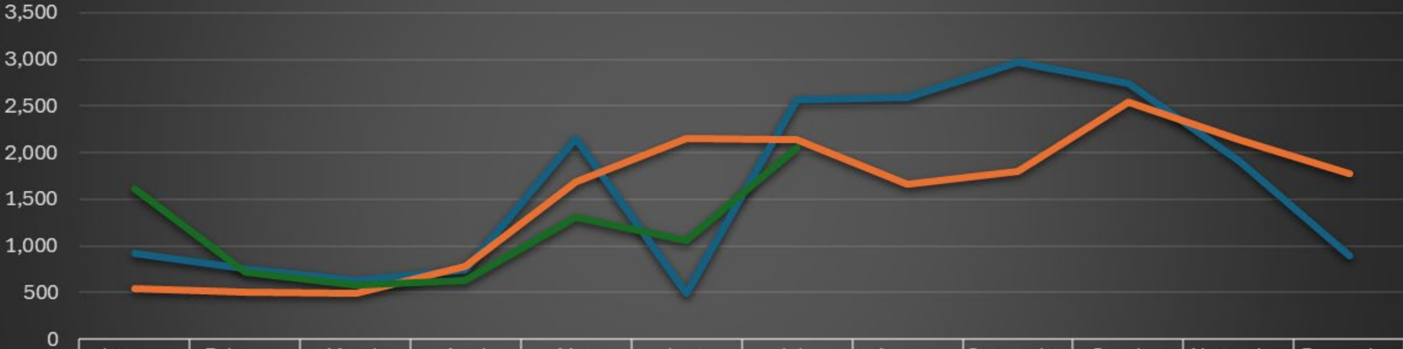
CLPOE Commercial Nothbound Vehicles 2022-2024