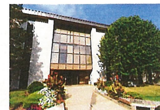
T or C