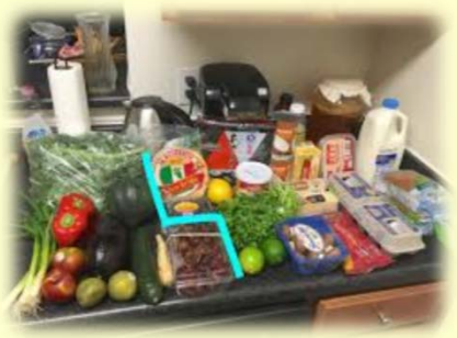
$50 a Month Food for Family of 4 For ONE Year!