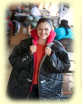
$20 Winter Coat, Hat & Gloves