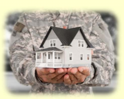
$100 a Month Furniture or Move-In Costs For Family of 4 to their New Home