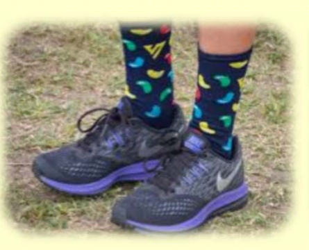
$30 Pants & Shoes