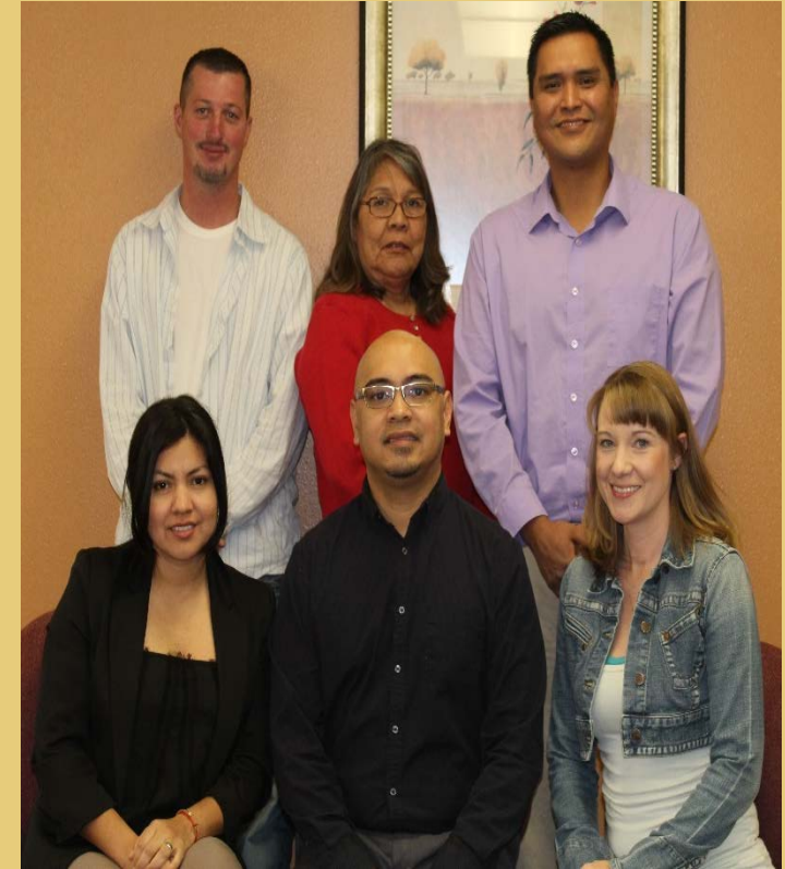
IBM Internship Program