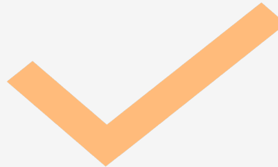
SPECIFIC DECISION AREAS, OR AS NEEDED