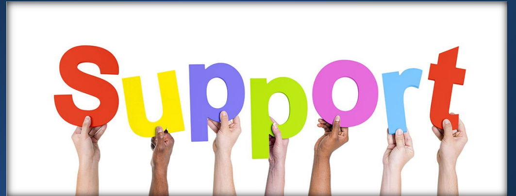
IMAGE DESCRIPTION: Hands holding up multicolored letters that spell "Support."