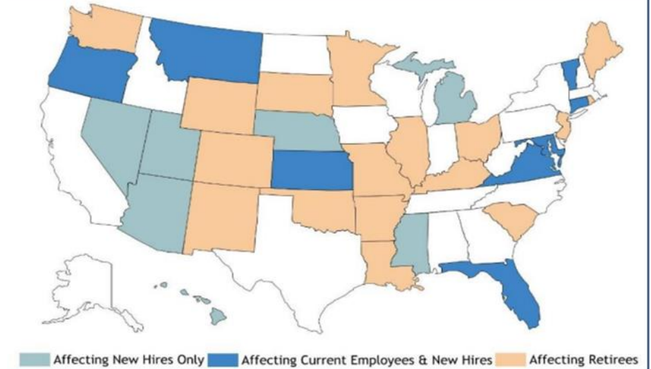
Figure 2: State retirement systems undergoing COLA legislative changes, 2009-2024