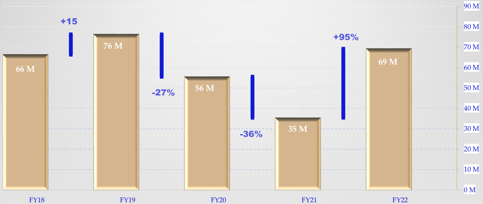
Revenue Share Fiscal Payments