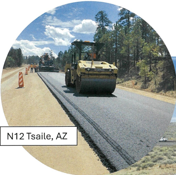
N12 Tsaile, AZ