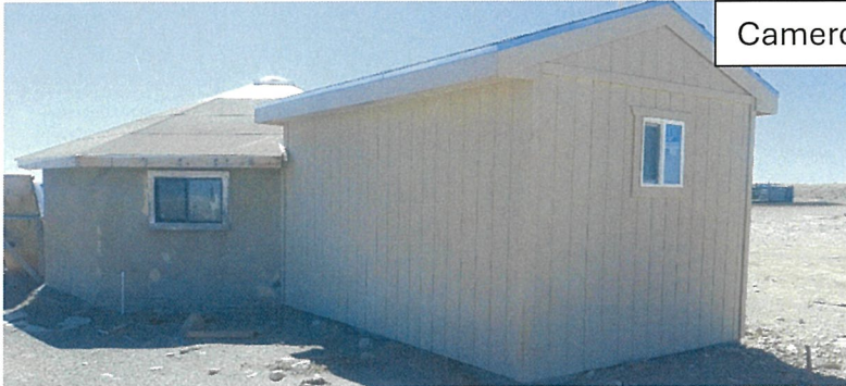
Cameron, Tolani Lake and Leupp, AZ

NECA is registered and certified to conduct business on and outside the Navajo Nation Pursuant to N.N.C. § 1972 (B) (12).