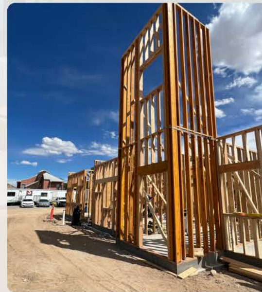
Walls are up