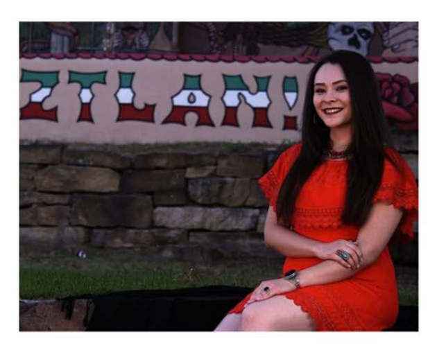
Championing Chicana/o Studies By Olivia Romo

Our graduates serve their communities by offering creative, analytical, and intercultural skills to diverse work environments.