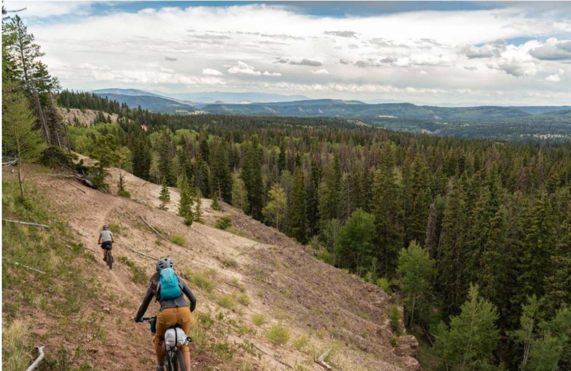
Bikepacking the Continental Divide Trail CDT in Northern New Mexico / August 18, 2020

RADAR REPORTAGE BEAUTIFUL BICYCLES REVIEWS SHOP VISITS RIDES SHOP