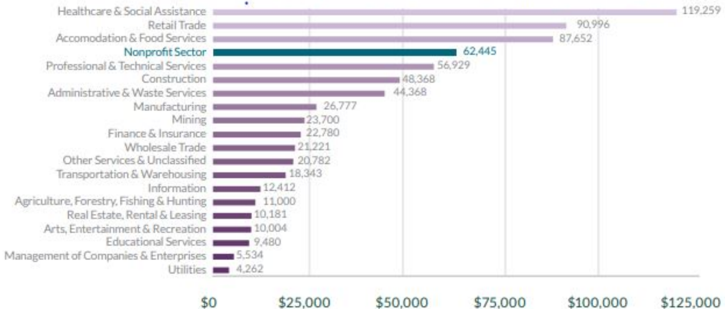
Figure 1 NM Nonprofit Employment Sector Comparisons, 2018