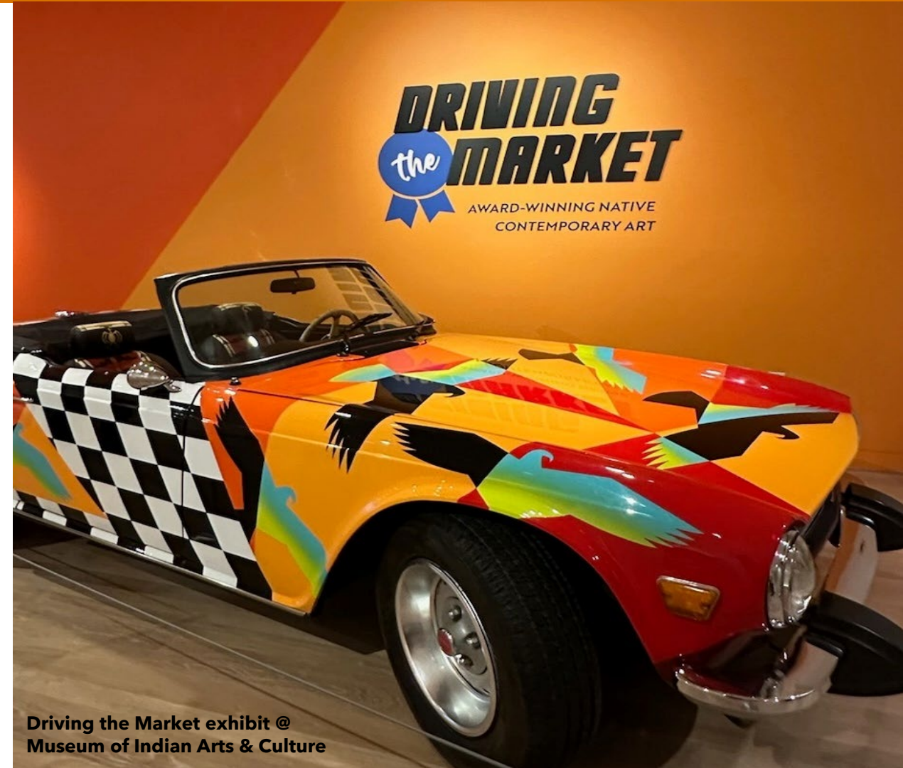
Driving the Market exhibit @ Museum of Indian Arts & Culture