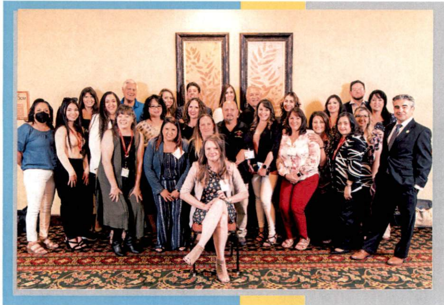
Above: The Staff of the 8th JDA at the NMDAA 2022 Spring Conference in Albuquerque, NM

Our Mission is to protect the public's safety by promoting justice through the fair and impartial prosecution of all felony and misdemeanor criminal cases, and miscellaneous civil matters.