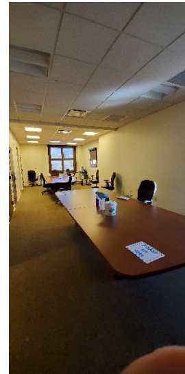
Expanded Jury Deliberation Room