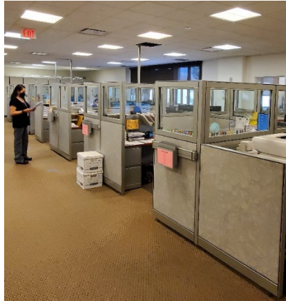
District and Magistrate Unified Clerks' Office