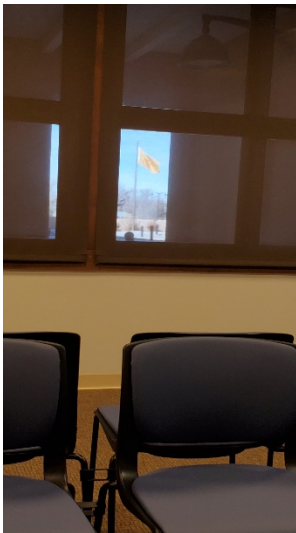
New Jury Assembly Room