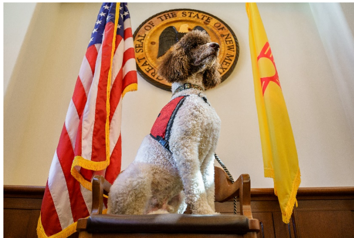
District/DA Court Therapy Dog