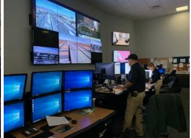
El Paso Matrix "Bridge" Operational Working Space

The DHSEM Homeland Security Bureau is also engaged in various working groups and represents the state within the National Fusion Center Association and the National Network of Fusion Centers, and closely collaborates with the US Department of Homeland Security's Intelligence and Analysis Office – including a co-located Intelligence Officer, ensuring direct and continuing engagement with the national intelligence community.