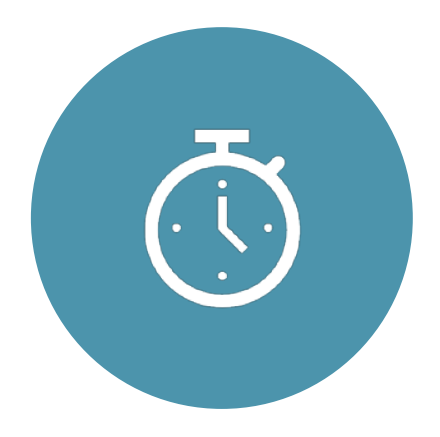
S PPOR NG OS O AR S NG PRAC ON RS O R F N AND S PPOR R NFORM D PRAC C