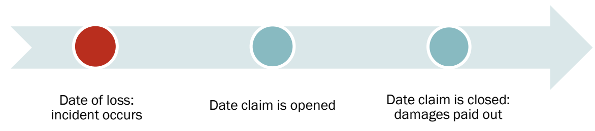
Figure 1: Sexual Misconduct Claims Timeline

According to NMPSIA, sometimes there is a major gap between when a sexual misconduct incident occurs and when a claim is opened. For example, NMPSIA reported just receiving a suppressed memory claim from 1997 alleging educator sexual misconduct that is not included in this data—as the date of loss is outside the 10-year parameter—however, this would still be an upcoming cost if the claim is paid out. It's also important to note there is often a gap, sometimes substantial, between the date when a claim is opened and when a claim is closed. The charts shown on the next page, Figure 2: Employee Sexual Misconduct Claims, 2013-2024 and Figure 3: Student on Student Sexual Misconduct Claims, 2013-2024, show a peak in costs in 2018, the dates reported represent the date of loss and not the date of payout; claims can take many years to be settled.