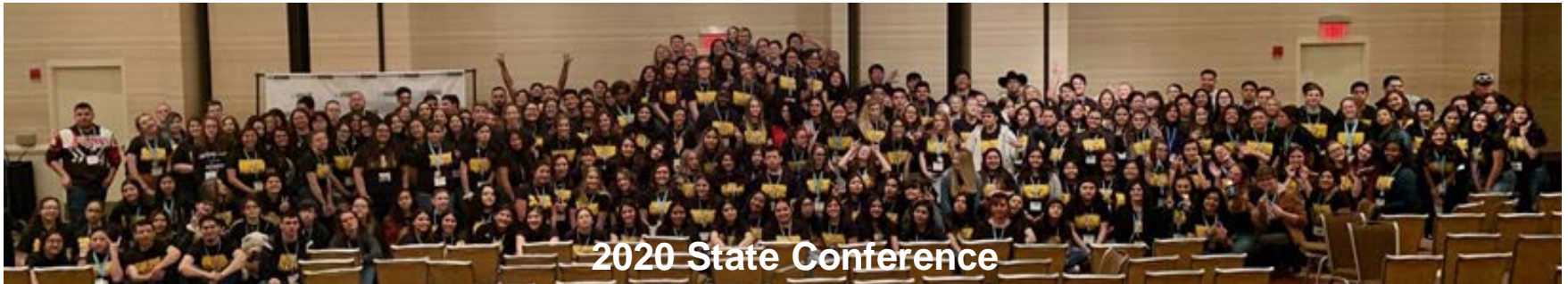
2020 State Conference