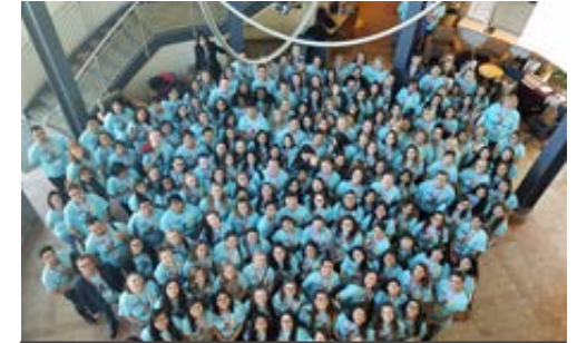
2018 State Conference