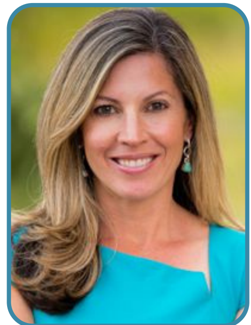
Senator Siah Correa Hemphill