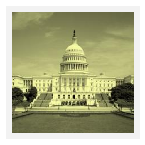
State Voice in D.C.

NCSL delivers training tailored specifically for legislators and staff