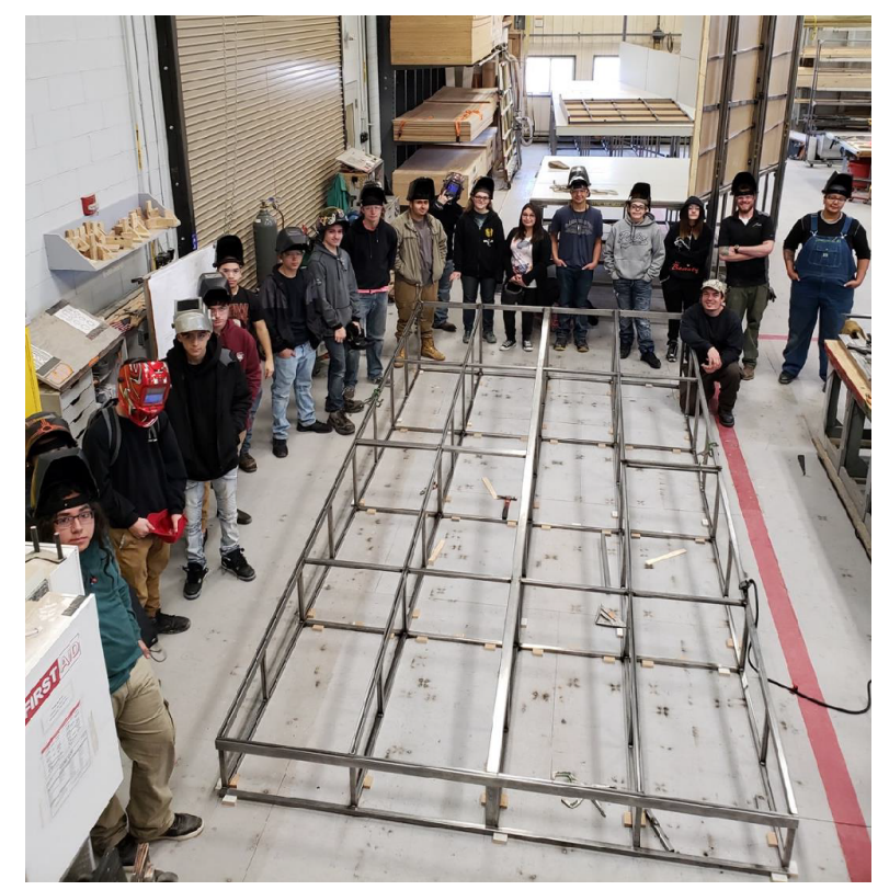
Students from the Early College Opportunities High School in Santa Fe built a portion of the raked deck for our 2019 Season production of Janáček's Jenůfa.

presented via Zoom. These included a props craft workshop, an introduction to costume design, drawing