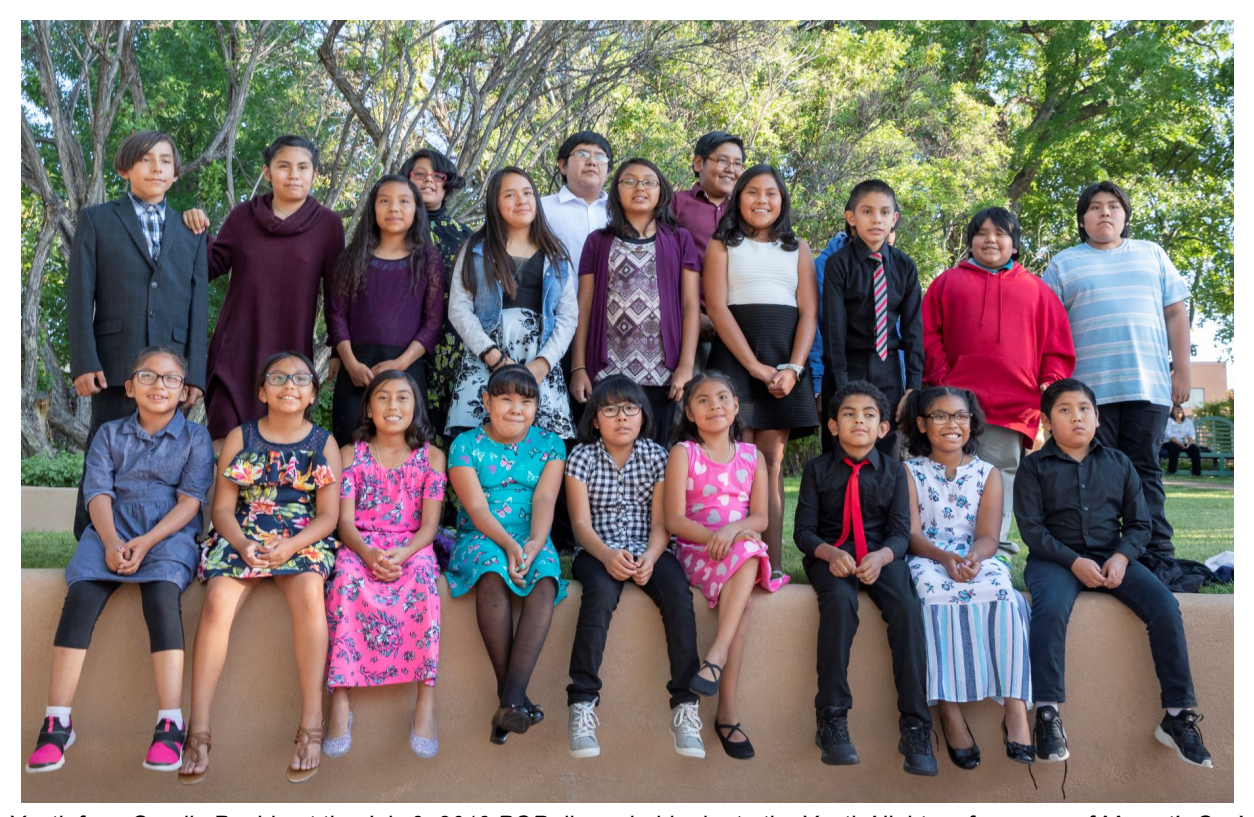
Youth from Sandia Pueblo at the July 9, 2019 POP dinner held prior to the Youth Night performance of Mozart's Così fan tutte.

Celebrating its 50th Anniversary in 2023, the Pueblo Opera Program forges strong connections between the opera and New Mexico's 23 Indigenous Nations. The program's hallmark is an exchange of culture: opera is a specific culture with distinct traditions and the pueblos and reservations have a very rich and deep tradition of storytelling and music, providing a common language and place to begin. An advisory council comprised of past participants and elders from participating pueblos and reservations guides the program, and each nation has its own volunteer coordinator. The pueblos attend all Youth Nights, and prior to the performance, they are served a healthy and nutritious meal in the Cantina from program sponsor Omaha Steaks. Given some nations are two to three hours away, the opera provides free round-trip transportation via coach. The President's Committee on the Arts and Humanities recognized POP as an exemplary arts & humanities program for at-risk children and youth in its 1996 publication, Coming Up Taller . Since its inception, the program has benefited over 120,000 children and their families.