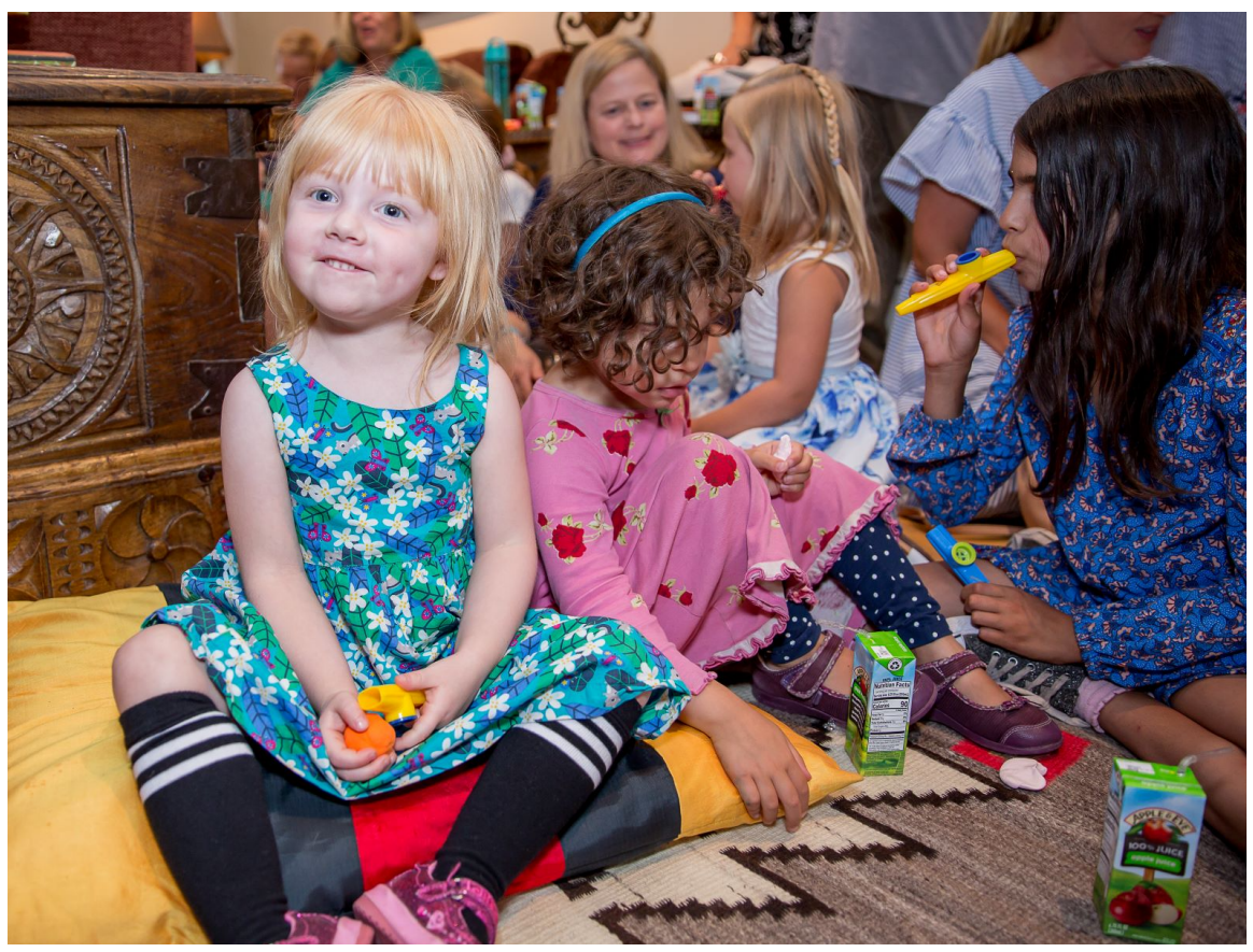
Young participants at the 2019 Opera Makes Sense which was held at the New Mexico Governor's Mansion.