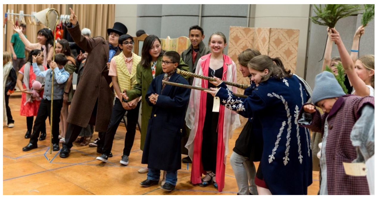
Youth Night attendees acting out Act Two of Puccini's La bohème at the June 24, 2019 presentation of "3, 2, 1... Opera!"

Since 1959, youth groups have attended final dress rehearsals of age-appropriate mainstage productions each season. Since its inception, Youth Nights have introduced more than 100,000 children to opera.