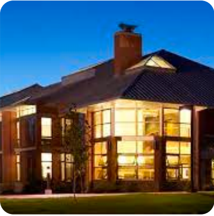
Renovation of existing student homes to include kitches, bathrooms, student den, living room, and update all funtiture.