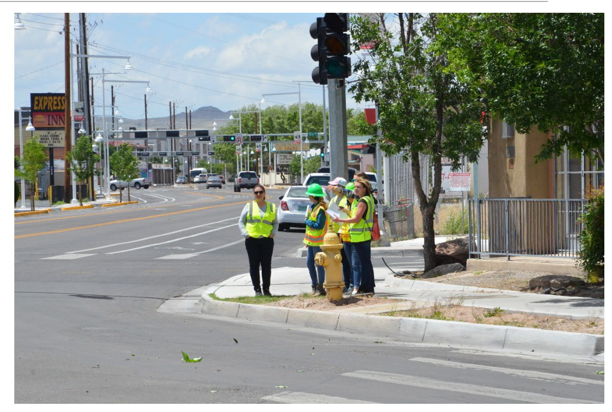
NMDOT and other government staff participate in a Designing for Pedestrian Safety course offered by FHWA