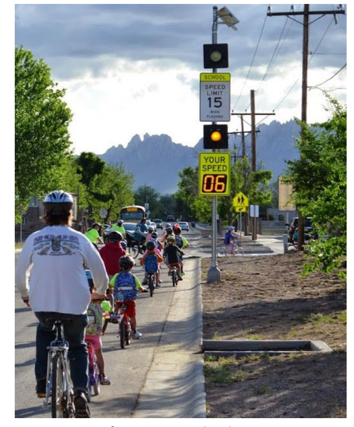
Las Cruces Safe Routes to Schools