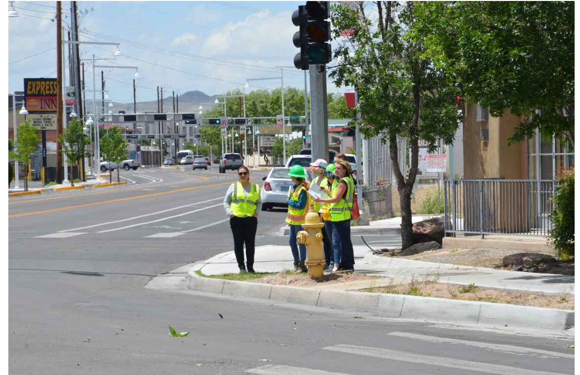
NMDOT and other government staff participate in a Designing for Pedestrian Safety course offered by FHWA