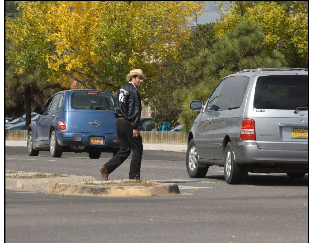
Pedestrian in Albuquerque