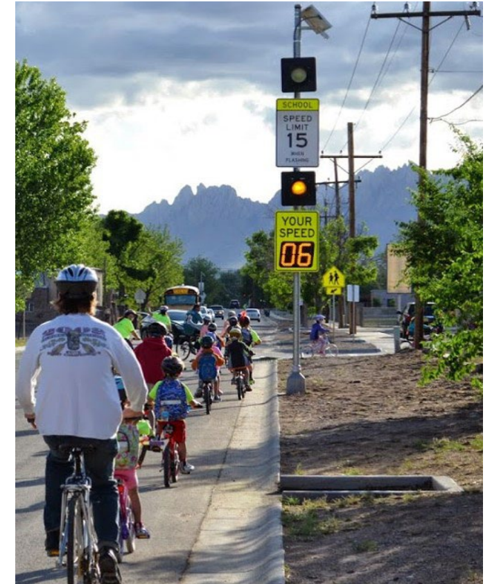
Las Cruces Safe Routes to Schools