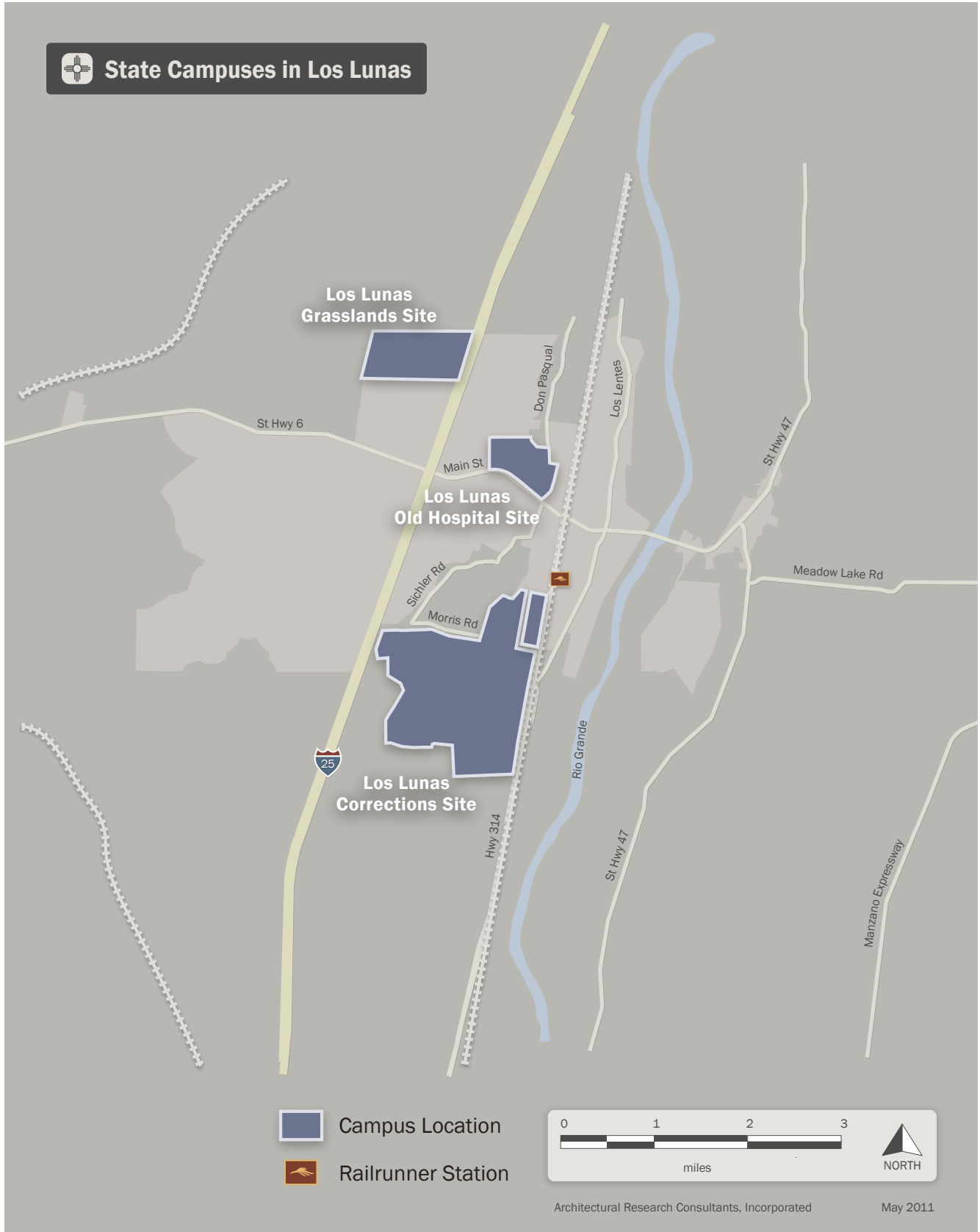
Exhibit 07. Los Lunas Campus Location Map