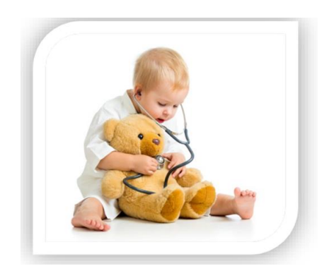
Child Abuse Response Team