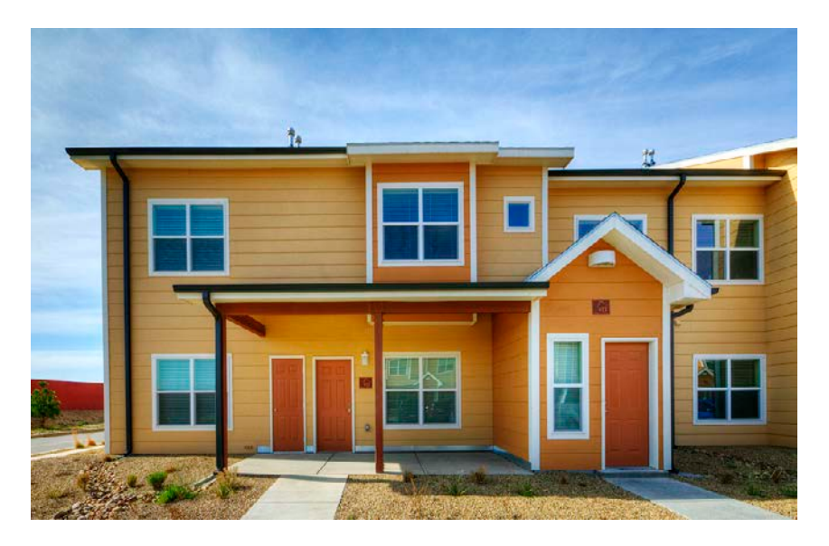
Chaco River II, Shiprock