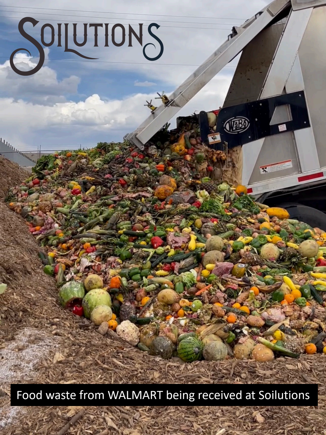
Food waste from WALMART being received at Soilutions