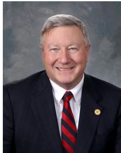
Senator Greg Nibert