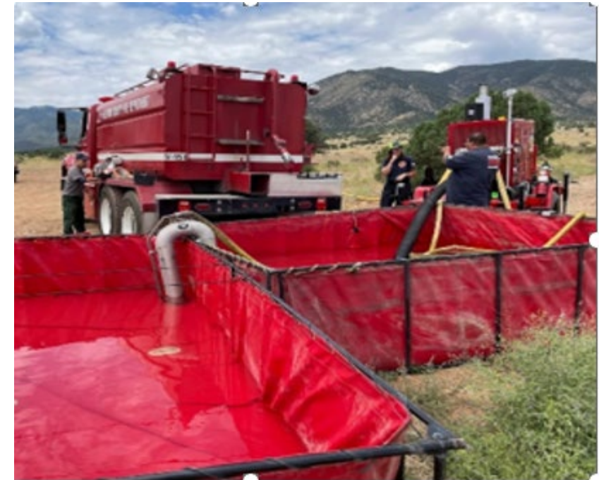
Top: Rio Communities Fire Dept filling a water tank for helicopter bucket dips. Left: Valencia County Wildland Captain providing leadership for initial attack.