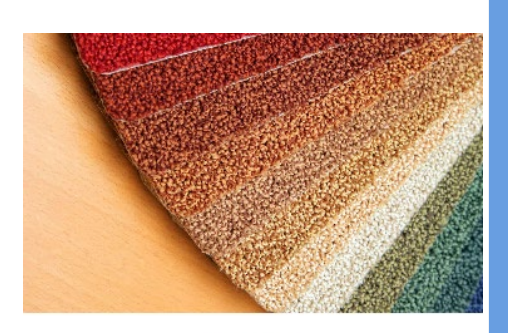
Carpet Carpet can be toxic, but is highly recyclable.