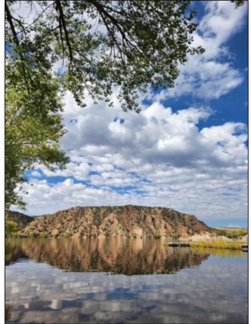
A cloudy morning looking over Santa Cruz Lake.

With gratitude we pay our respects to the land, the people and the communities that contribute to what today is known as the State of New Mexico.