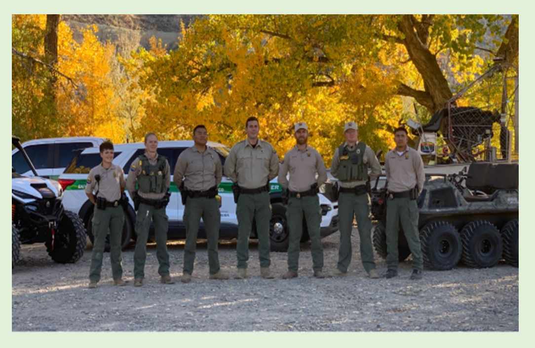
Park Rangers at Navajo Lake State Park