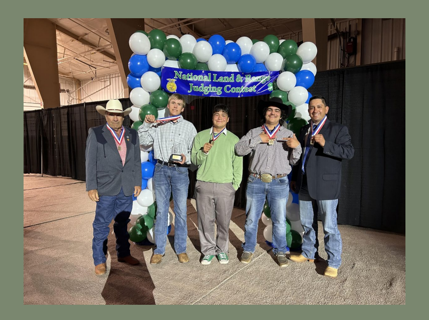
Sierra County 4-H 4<sup>th</sup> Place Land Judging at National Competition