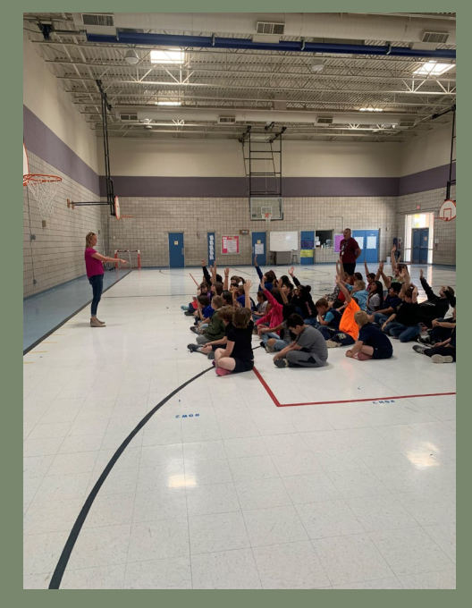
4<sup>th</sup> Grade – Byproducts