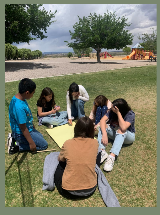
5<sup>th</sup> Grade – Range Mgmt