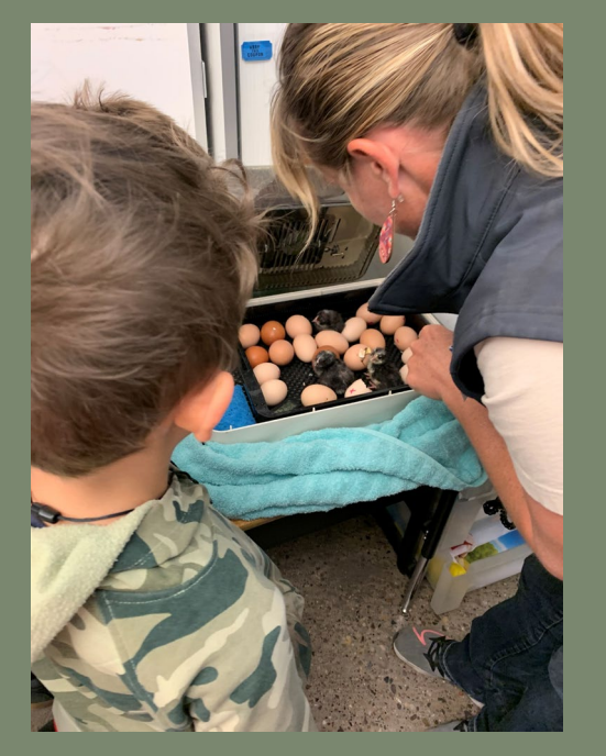
3<sup>rd</sup> Grade – Egg to chick