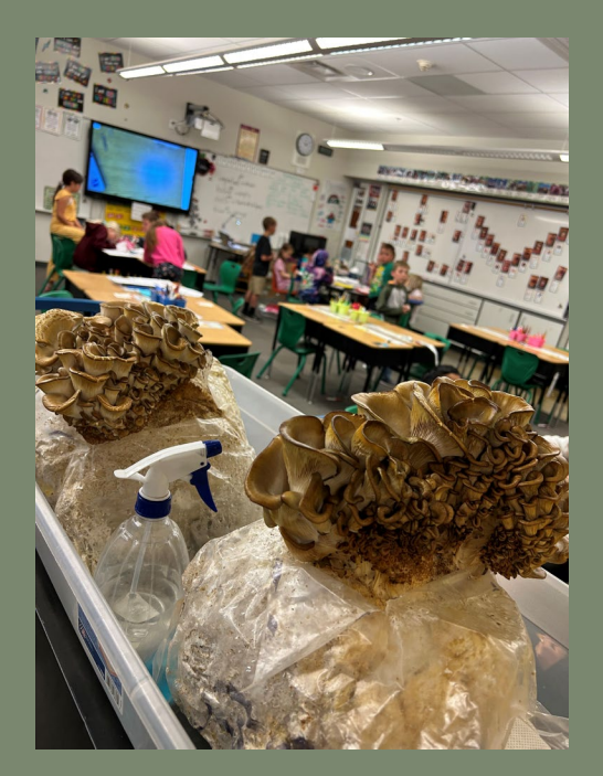
2<sup>nd</sup> Grade – Mushrooms