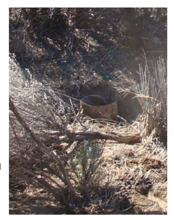
Abandoned Well previously buried underground