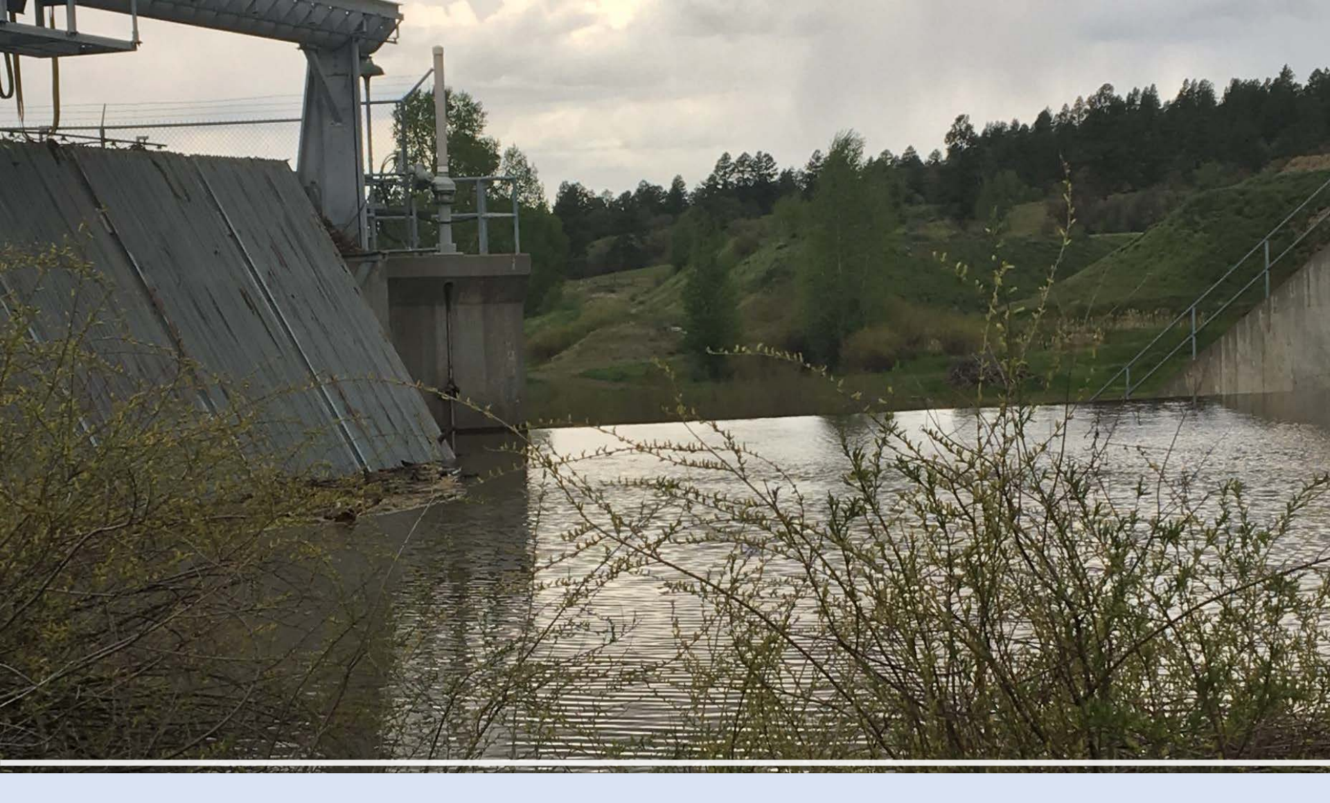
OSO DIVERSION DAM – Largest on the Three